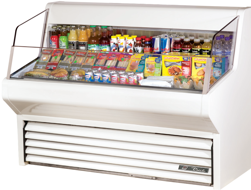
Shown with optional white exterior.

Horizontal Air Curtain Refrigerated Merchandiser with Hydrocarbon Refrigerant & LED Lighting